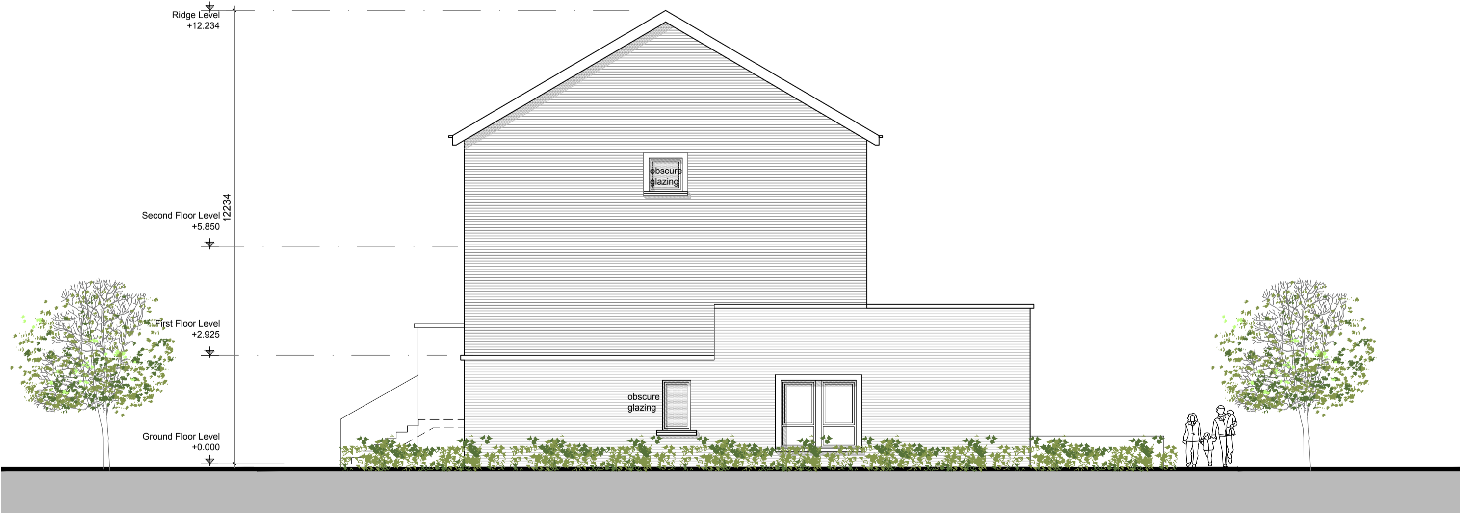
DUPLEX TYPE 1 - SIDE ELEVATION (DUPLEX TYPE 3B2) LEFT SIDE RIGHT HAND