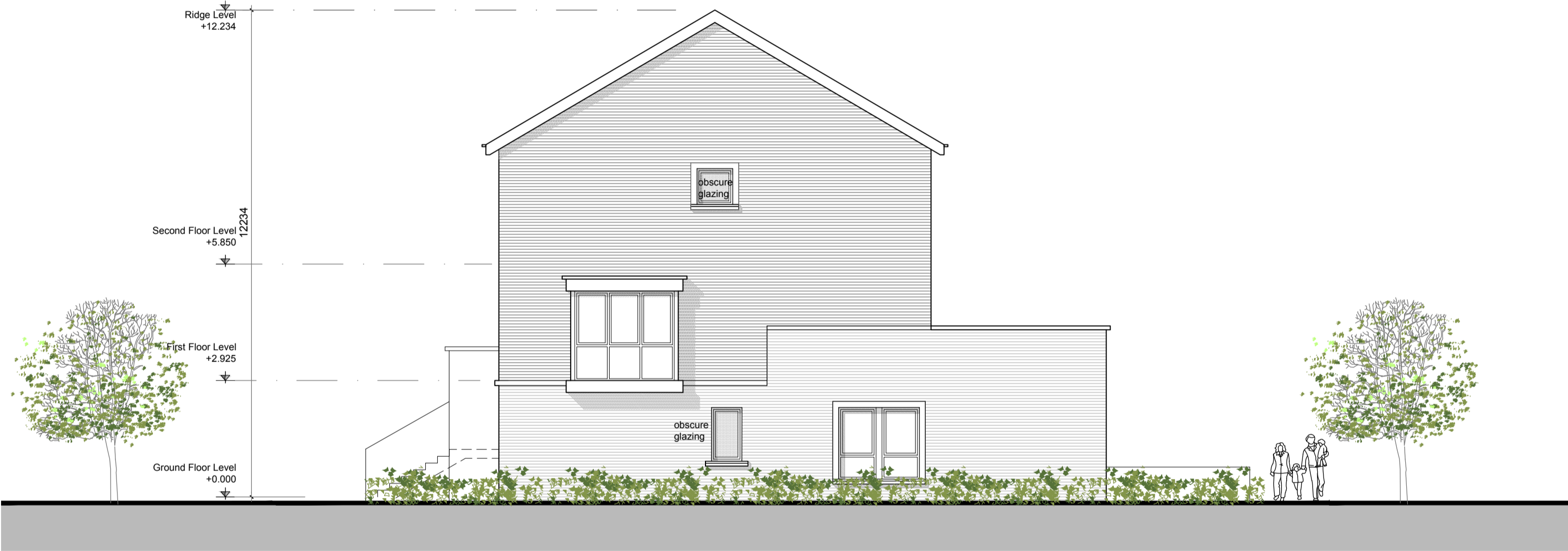
DUPLEX TYPE 1 - SIDE ELEVATION (DUPLEX TYPE 3B2) RIGHT SIDE RIGHT HAND