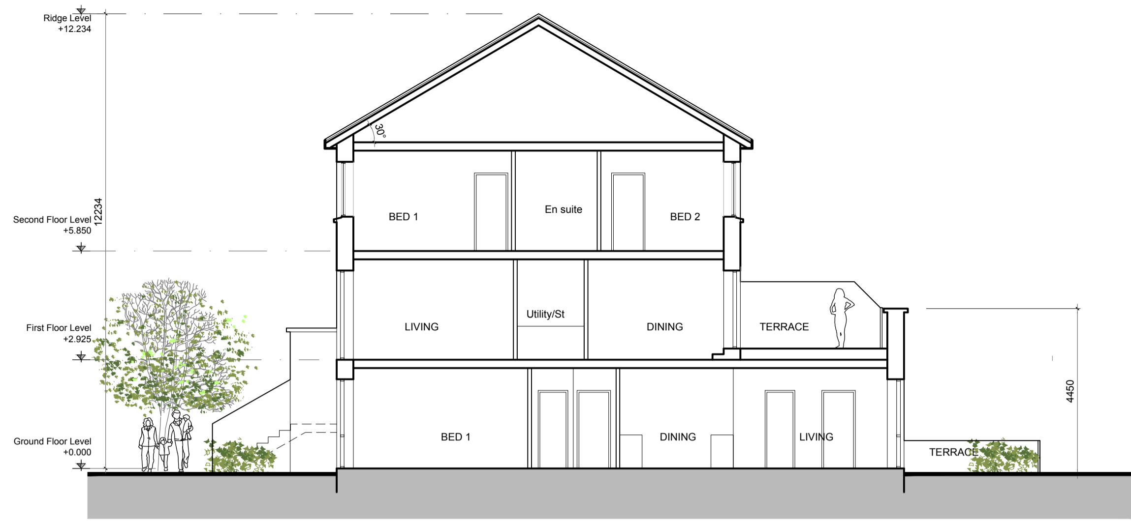
DUPLEX TYPE 1 - SECTION A-A