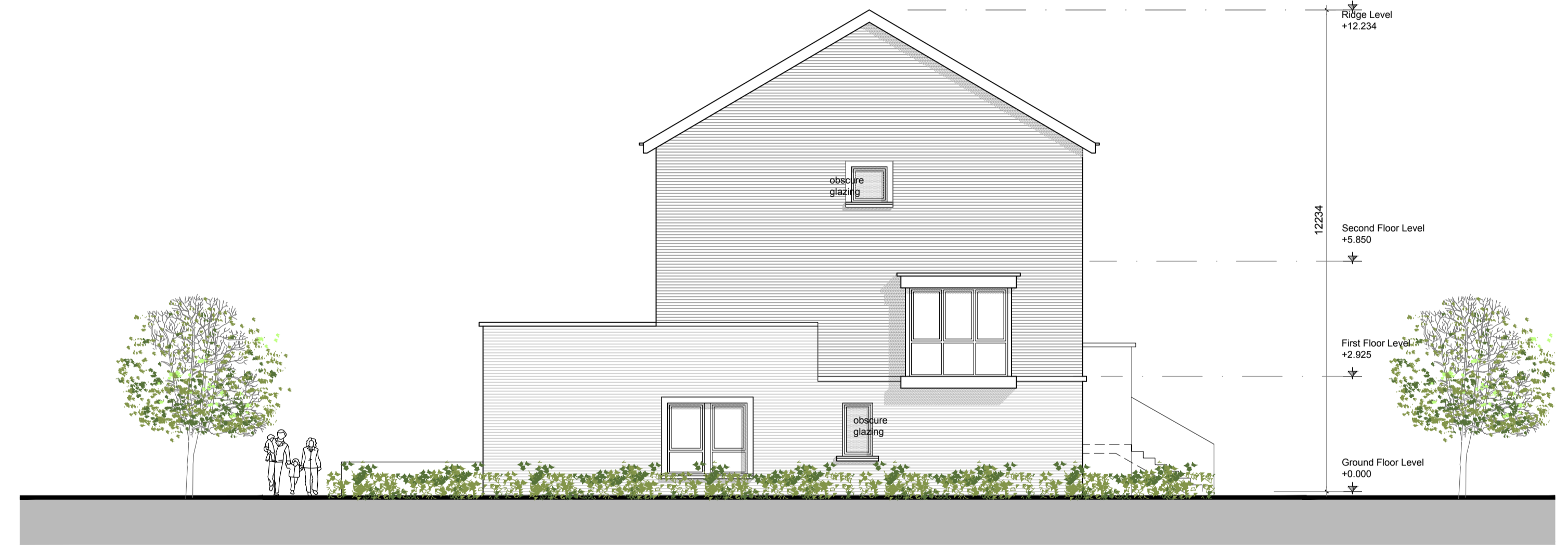
DUPLEX TYPE 1 - SIDE ELEVATION (DUPLEX TYPE 3B2) LEFT SIDE LEFT HAND