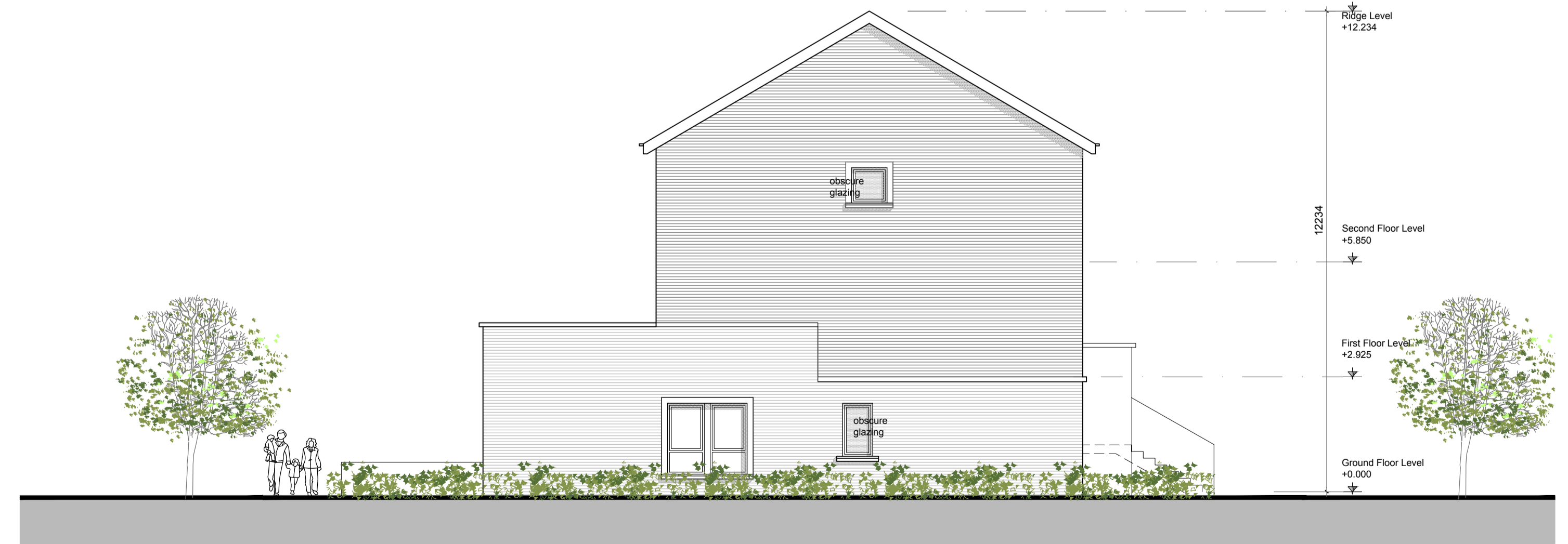
DUPLEX TYPE 1 - SIDE ELEVATION (DUPLEX TYPE 3B1) RIGHT SIDE LEFT HAND